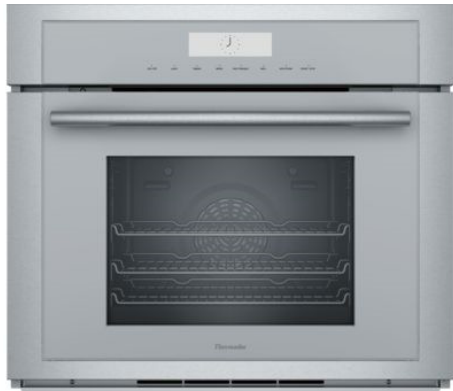
30-Inch Masterpiece® Single Steam Oven MEDS301WS

Often preferred by professional chefs, steam ovens produce dishes with unmatched texture, appearance, and of course, taste. Steam provides heat without sacrificing moisture or flavor, so food turns out crisp on the outside and moist on the inside—even after reheating. Thermador Steam Ovens feature the largest 30-inch steam capacity on the market, with multiple racks to hold all of your culinary ambition. And think beyond fish and vegetables—use your Thermador Steam Oven for baked French breads, as well as the ability to cook a 14 pound turkey in 90 minutes.