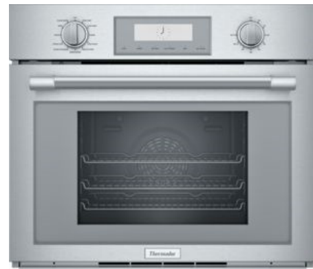
30-Inch Professional Single Steam Oven PODS301W