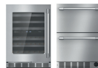
Any Under Counter Refrigeration