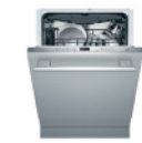
Get a FREE EMERALD® Dishwasher