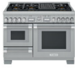
Buy a 36", 48" or 60" Professional Range