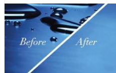
*Available on Sapphire and Star Sapphire Models Only

The most Exceptional drying power in the world. Thermador's Zeolite technology, reducing the need to towel dry items. No other dishwasher dries better.